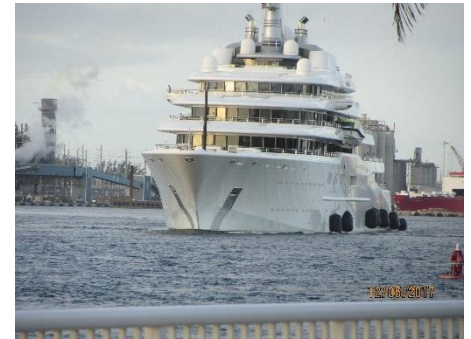
One of the highlights of the December season was seeing the Eclipse leave the Port of Palm Beach in early December. The Eclipse is the second largest motor yacht in the world at 536' and is owned by Russian oligarch Roman Abramovich. It was in our nearby port for maintenance.