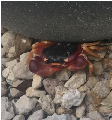
Halloween crab hanging out in the pool pump enclosure.