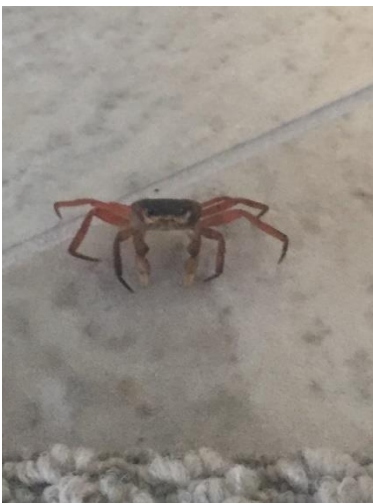
Another visitor found swimming in the pool.