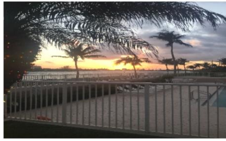
Sunrise and sunset views from Singer Island.