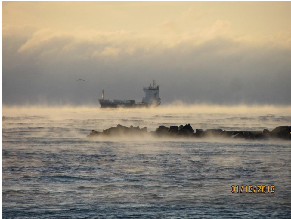
MIST ON THE WATER THIS JANUARY