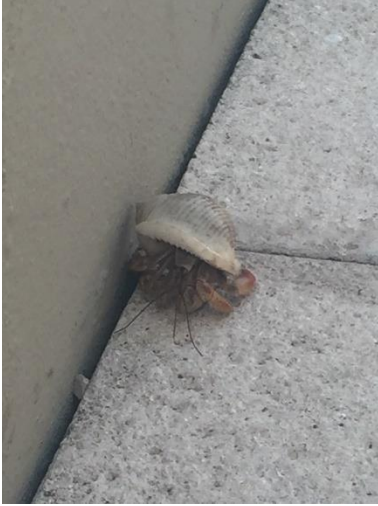
Hermit crab hanging out at the pool.