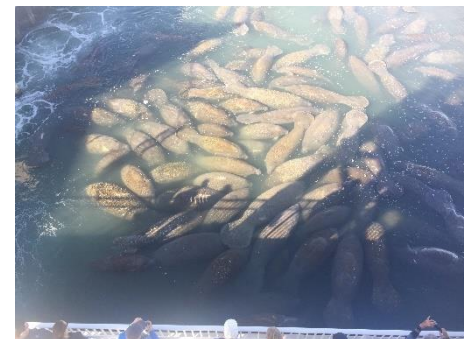
If you were around during January, hopefully, you were able to get over to FPL's Manatee Lagoon. It was quite a sight during that cold spell that we had. You could probably walk across the lagoon on their backs there were so many.